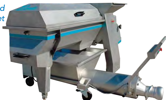
Destemmer-red grape pump set