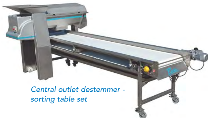
Central outlet destemmer - sorting table set